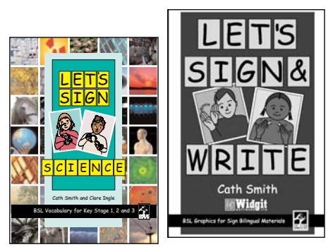
BSL Graphics packs (Dictionary and CD) to make your own materials