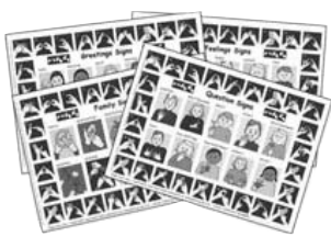
Posters, Flashcards & Stickers