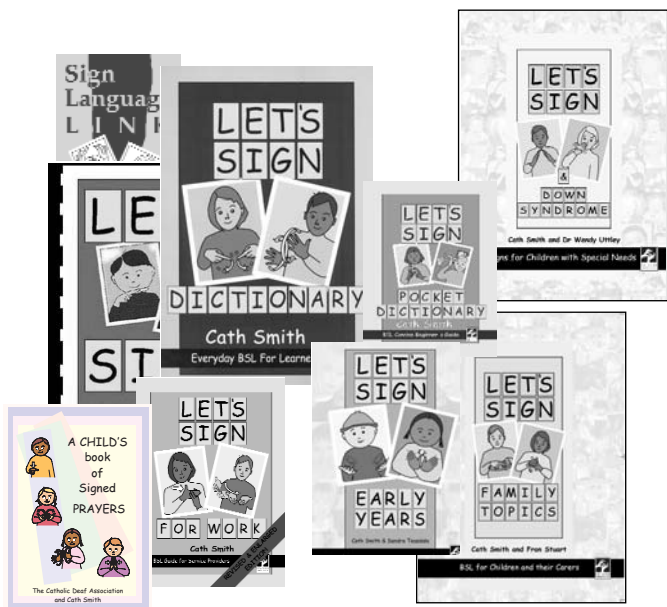
Dictionaries and Guides

British Sign Language (BSL) educational materials from DEAFSIGN, for Early Years to Adult learners www.deafsign.com